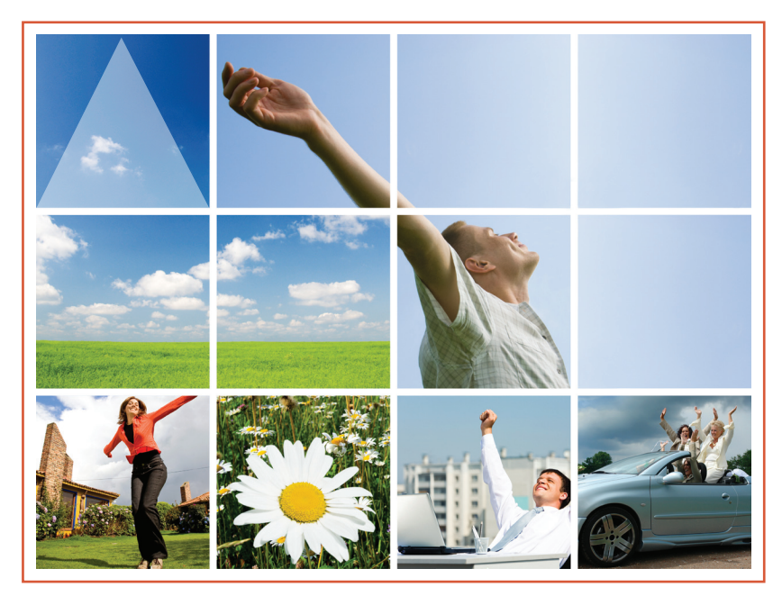
Insure Today. Secure Tomorrow.